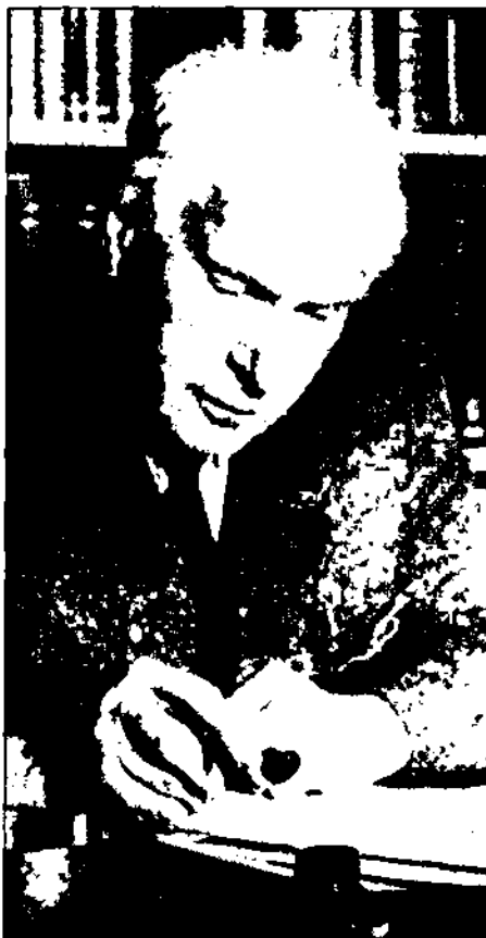
C. J. JUNG

Unfortunately, Jung's purely speculative sallies into alternative interpretations have led to considerable misunderstanding — a very active misunderstanding that was prepared to latch onto anything to feed itself. This misconception has resulted in some ufologists claiming that Jung supported this, that, or the other theory, simply because he mentioned it and made a few cogent comments.